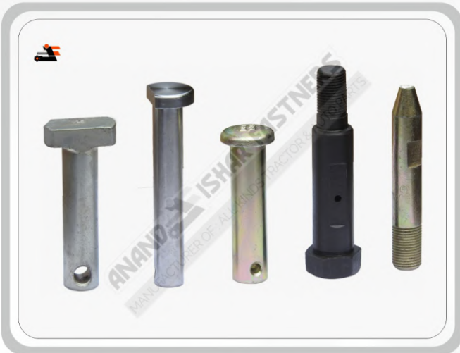
Tractor Pins / #Tractor Parts