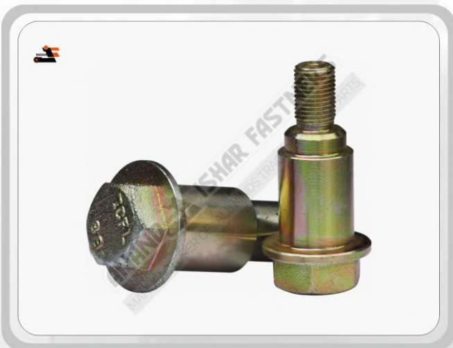
Tractor Bolts / #Tractor Parts

CUSTOM SOLUTIONS & PRODUCTION AVAILABLE WE MAKE AS PER CUSTOMER DRAWING AND SPECIFICATIONS