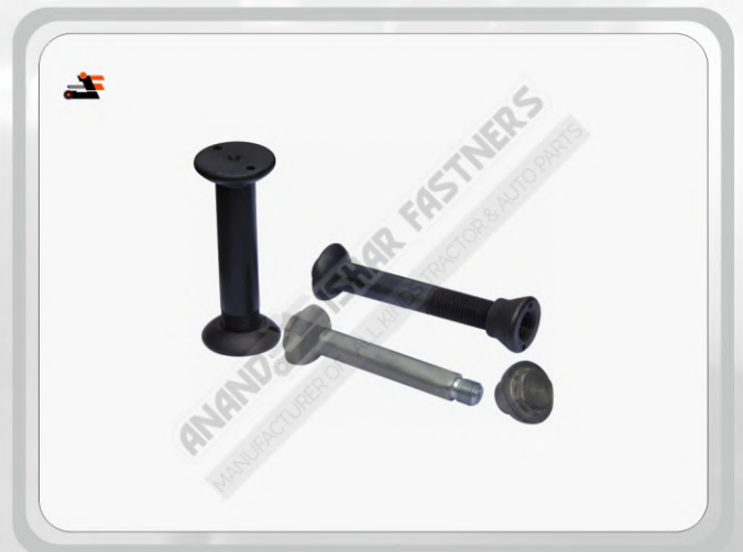
Mounting Bolts / #Special Items