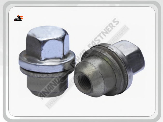
Wheel Nuts / #Auto Parts