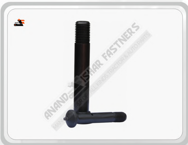
Special Bolts / #Special Items