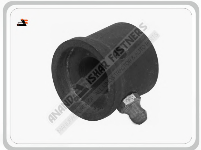
Dust Cover / #Tractor Parts