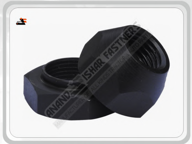
Nuts / #Tractor Parts