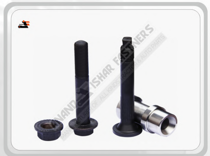
Underhead Klearing Bolts / #Auto Parts

CUSTOM SOLUTIONS & PRODUCTION AVAILABLE WE MAKE AS PER CUSTOMER DRAWING AND SPECIFICATIONS