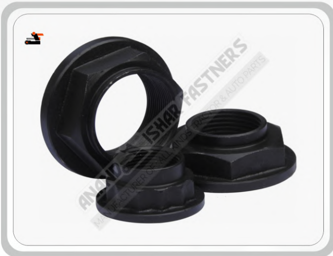
Flang Nuts / #Fastener Items