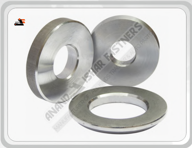
Washers / #Tractor Parts