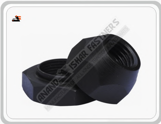
Nuts / #Auto Parts