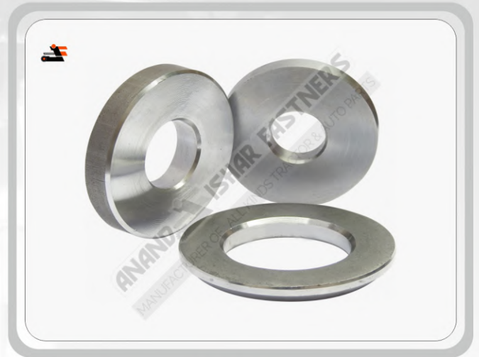
Washers / #Fastener Items