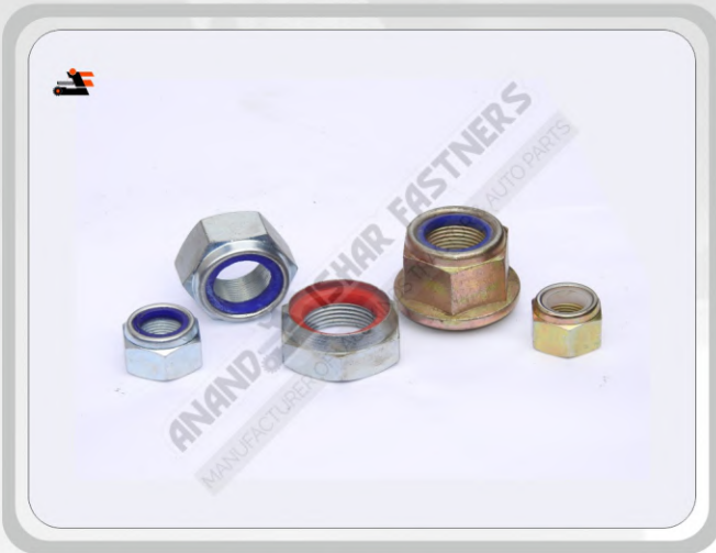
Nylock Nuts / #Fastener Items