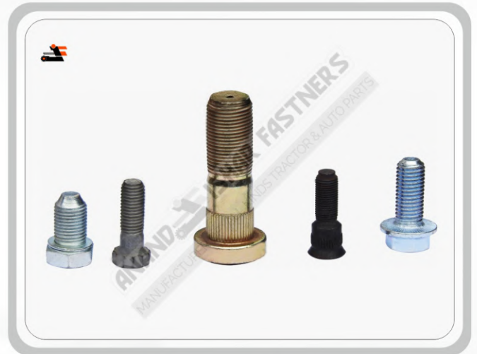
Hub Bolts / #Fastener Items