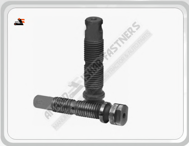
Thread Pins / #Auto Parts