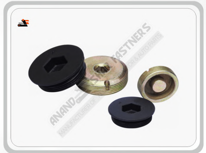
Combine Chamber Nuts / #Auto Parts

CUSTOM SOLUTIONS & PRODUCTION AVAILABLE WE MAKE AS PER CUSTOMER DRAWING AND SPECIFICATIONS